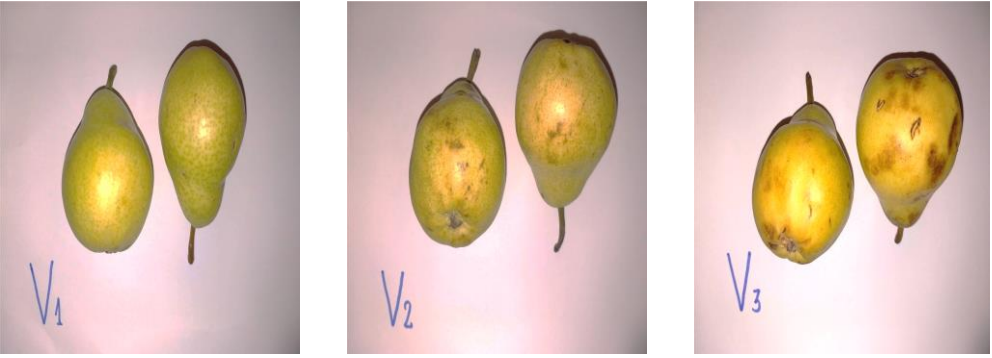
Figure 1. Experimental variants - Curé variety

V3 - fruits introduced into the cold room after a pre-storage of 15 days at a temperature of 9-12 ^{\circ}C and relative humidity of 75-80%