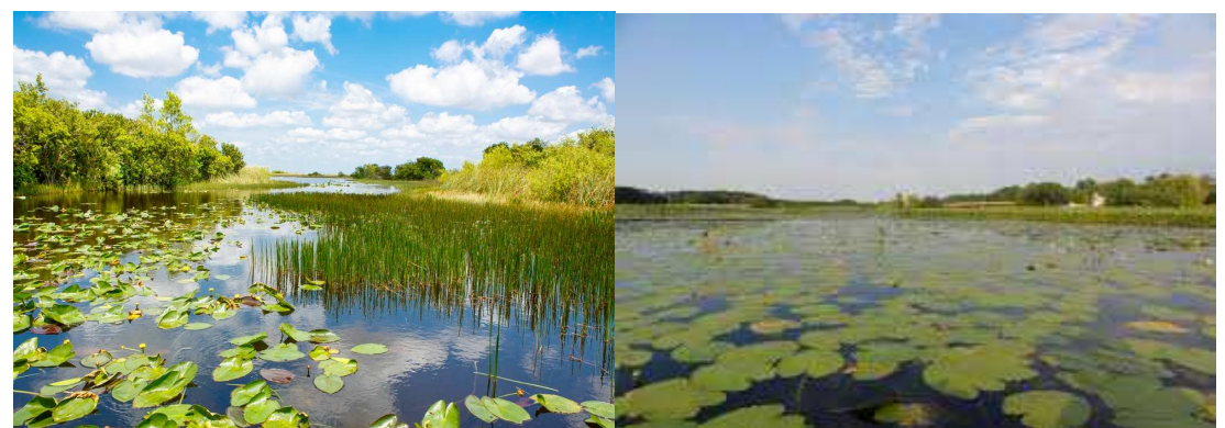
Figure 1. Natural wetlands

Just because of water purification benefits of the natural wetlands, researchers focused on constructed wetlands through imitating natural processes for wastewater treatment purposes (Figure 2). Constructed wetlands, so called as natural treatment systems, are generally constructed for wastewater treatment purposes especially in rural sections. These systems are man-made systems constructed as to imitate the on-going processes in natural wetlands (Gokalp and Kanarya, 2018). In this study, initially a brief information was provided about constructed wetlands, then nutrient removal mechanisms of constructed wetland systems were presented, and recommendations were provided for more efficient removal of nutrients with different substrate materials in constructed