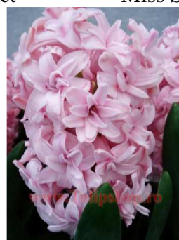
'Double Prince of Love'