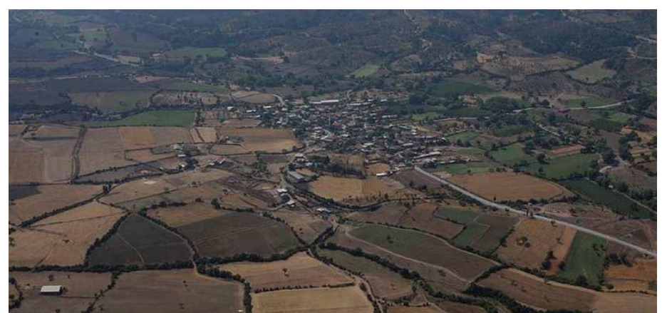
Figure 3. Fragmented lands of agricultural enterprises

consolidated land. Since various disciples work together in land consolidation projects, there are always conflicts among them. Such conflicts then make the progress impossible in some projects. Therefore, a well cooperation and integration among them should be provided to better and quick implementation of the projects (Bilgin, 2014).