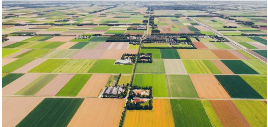
Figure 2. Land consolidation within the scope of GAP project

consolidation works initially over the irrigated lands (8.5 million ha). The Ministry of Food Agriculture and Livestock is planning to finish up land consolidation works over 14 million ha land area by the year 2023 (Anonymous, 2017).